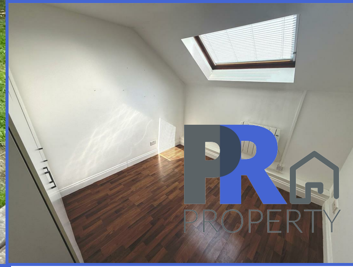
Flat 7, Lathwell Court Reginald Street, Luton, Bedfordshire, LU2 7QZ £135,999